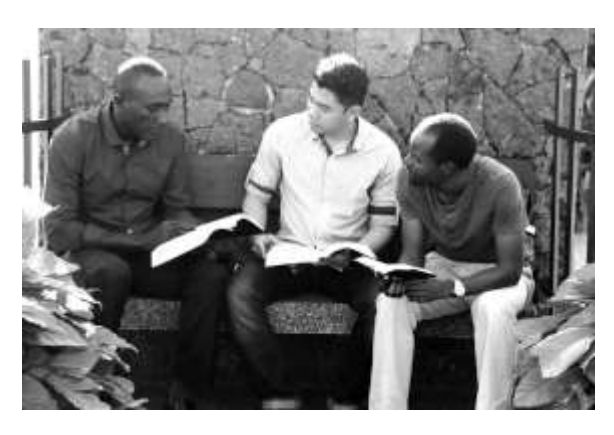
Studying the Word of God

The In-Ministry DMin students should finish the program within 10 years.