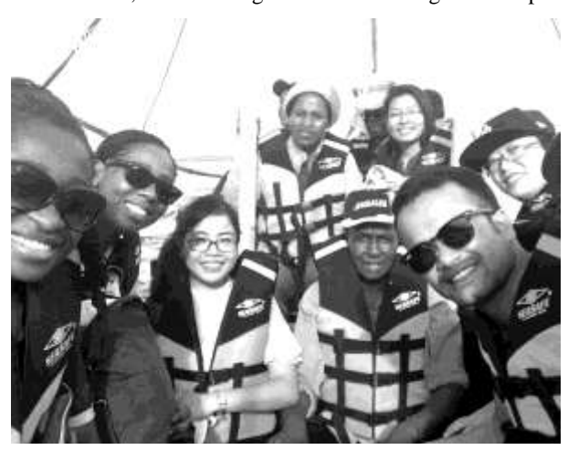
MPH Environmental Health Class on Disaster Management Training

The MPH Handbook, which gives further guidelines, is available in the Department and on the AIIAS web page (under Public Health Department). The handbook contains general information about the Public Health Department and gives guidelines for choosing and writing a thesis, choosing and taking the comprehensive exam, and fulfilling the Field Learning Internship.