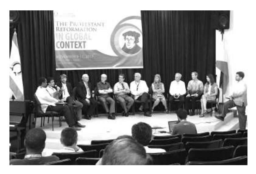
20<sup>th</sup> AIIAS Annual Theological Forum

Based on the student's ministerial experience the requirements for the Practicum course may differ.