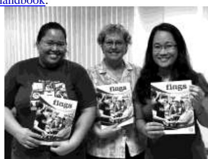
Magazine for Alumni

For detailed information on student services, please refer to the Student Handbook available from the Student Services Office or online at aiias.edu/studenthandbook.