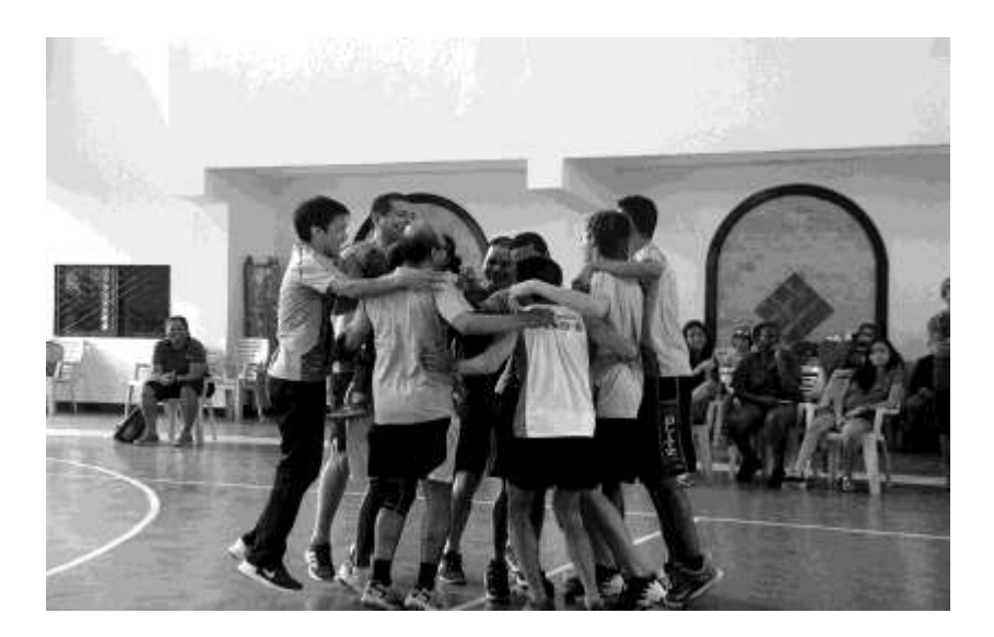
Work Together as a Team

This course is designed to cover current issues and developments in financial accounting. The topics covered depend on the current issues in the field of financial accounting. It is designed to familiarize students with current issues and problems facing the accounting profession, to examine in depth various solutions proposed by accounting scholars and others, and to strengthen students' understanding of today's critical issues in accounting theory. Graduate registration involves a study of advanced issues in accounting. Pre-requisite: Financial Accounting II.