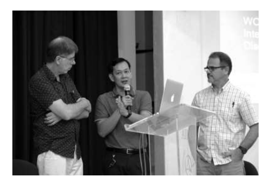
Discussing Important Issues

An exploration of the key expansion and strategies of the church missionary movement from first century to the present. It will emphasize among others the biblical and theological principles of sharing the gospel to the world with a focus in studying and evaluating the different theories, models and strategies in doing mission.