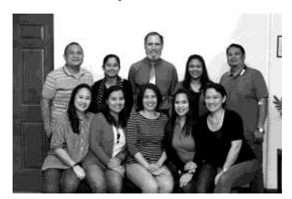
Admissions and Records, Academic, and Student Services Departments

A student who does not meet regular admission criteria or does not wish to receive graduate credit may be allowed to register on a non-credit enrollment basis. This status is also available to students who have not provided documentation showing eligibility for graduate work. A student who submits pertinent documents before the end of the semester may earn credits for his/her coursework that semester (provided all course requirements have been completed) and his/her status will be reevaluated.