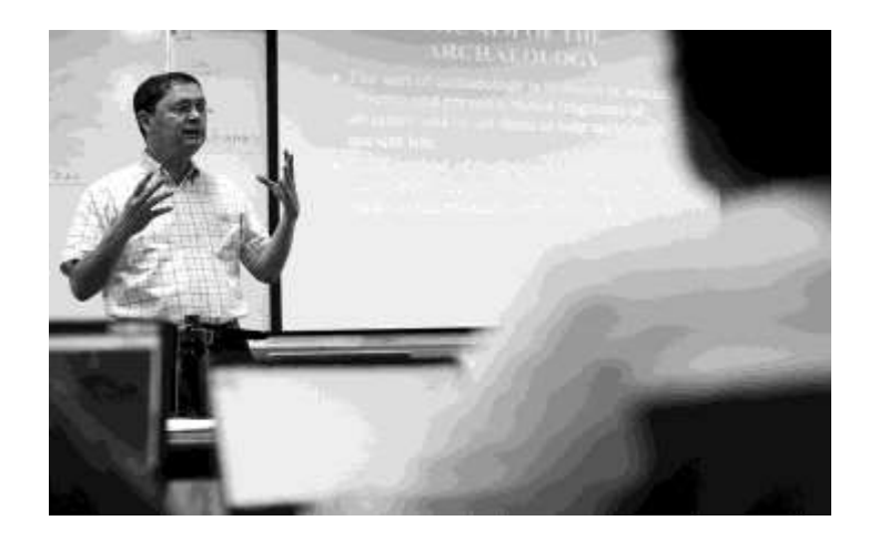
Teaching in the Classroom

MTh program Credits accrued at AIIAS are fully transferable toward a PhD in Religion at AIIAS, conditional to meeting the PhD program requirements, and the MTh degree not being awarded.