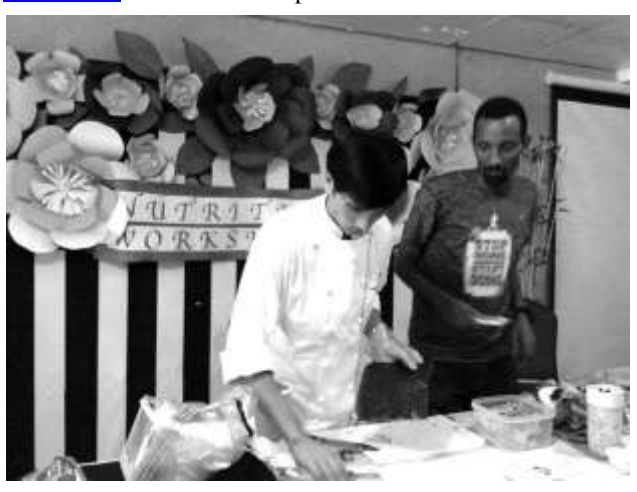
Healthful Recipes Demonstration